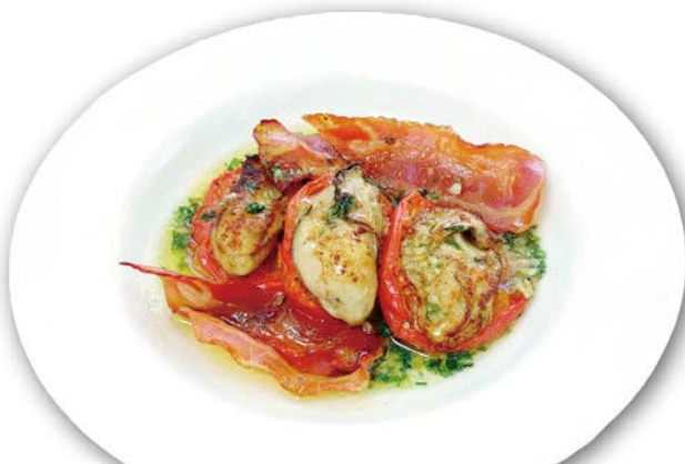
Garlic butter sauteed oysters and tomatoes