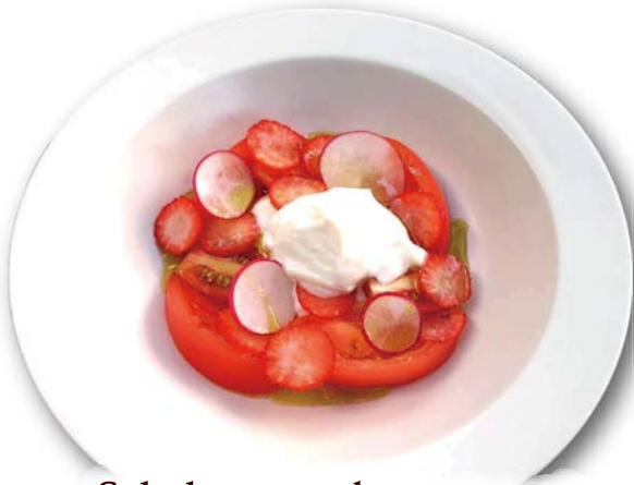
Salad at strawberry tomato and mascarpone cheese