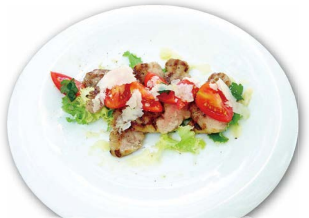
Grilled Hiroshima pork loin