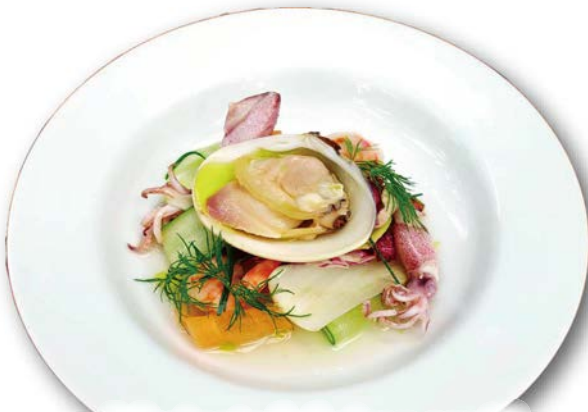
Marinated shrimp squid and big clam